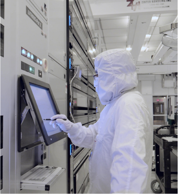
EUV work station at Albany NanoTech Complex