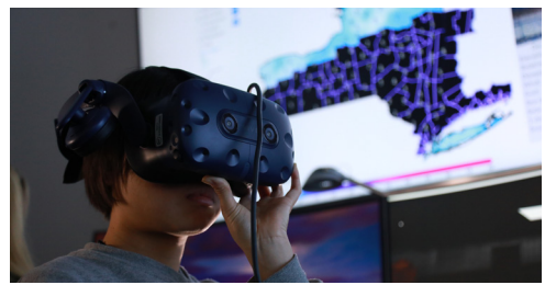
UAlbany XCite Lab