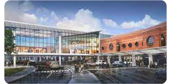
Albany Airport Rendering of Expansion