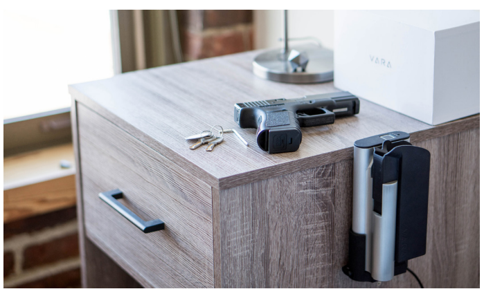
Reach Holster Safe